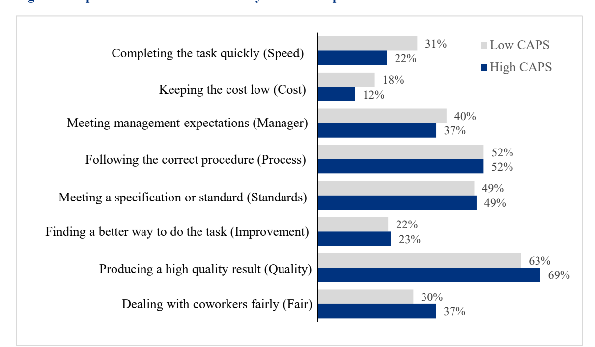
Figure 3. Importance of Work Outcomes by CAPS Group

As shown, low CAPS employees were somewhat more likely than high CAPS employees to consider high speed and low cost important. High CAPS employees were more likely to place a high value on quality and fairness. There are several reasons why low CAPS employees might place a (somewhat) higher value on high speed and low cost. First, they might be less confident that more careful work will make a difference to the result. Second, they might receive feedback or other cues that indicated that minimizing time and cost is valued over outcomes such as quality or customer satisfaction. Conversely, it makes theoretical sense for high CAPS employees to prioritize quality if they believe that it is within their power to achieve.